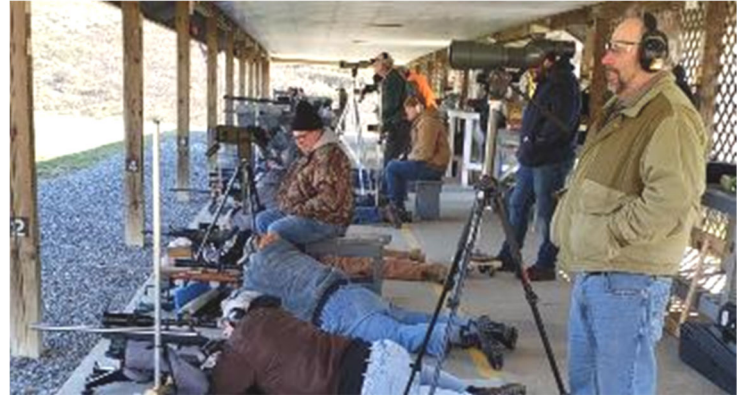
Shooters take aim at their eggs while spotters check for accuracy.